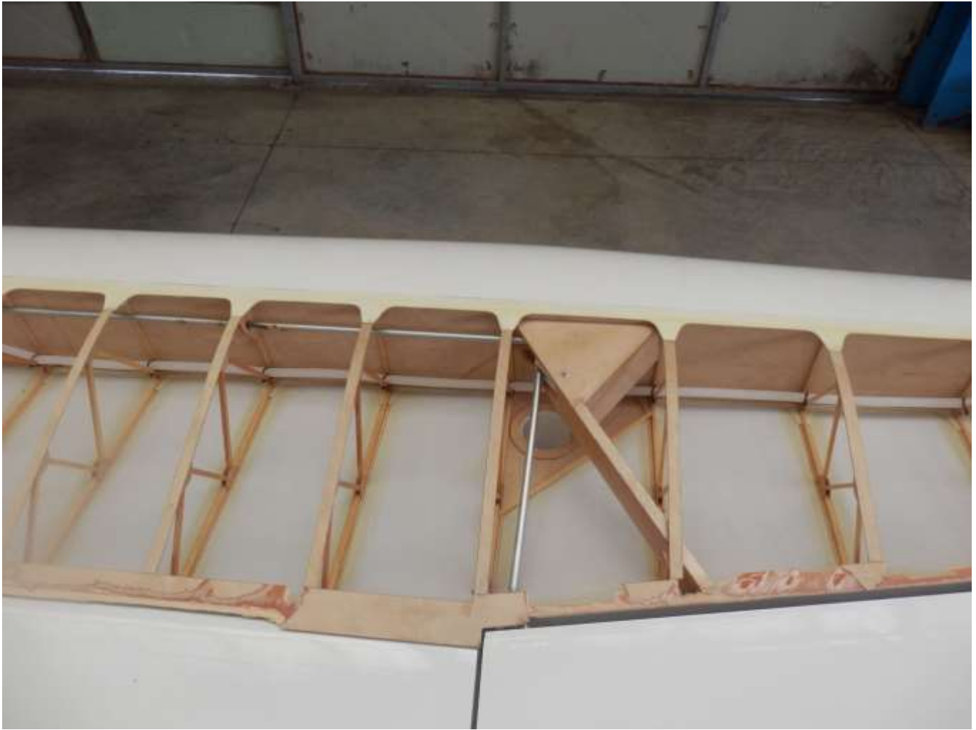
Pic. 3: Fabric coating separated from the upper part of the right wing

volejnik@atecaircraft.eu Tel.: +420 603 579 358 sales@atecaircraft.eu International: +420 731 440 144