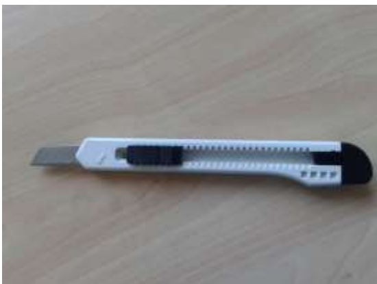
Pic. 1: example of the tool suitable for inspection of coating attachment

Tools: any thin knife (scalpel), measuring equipment