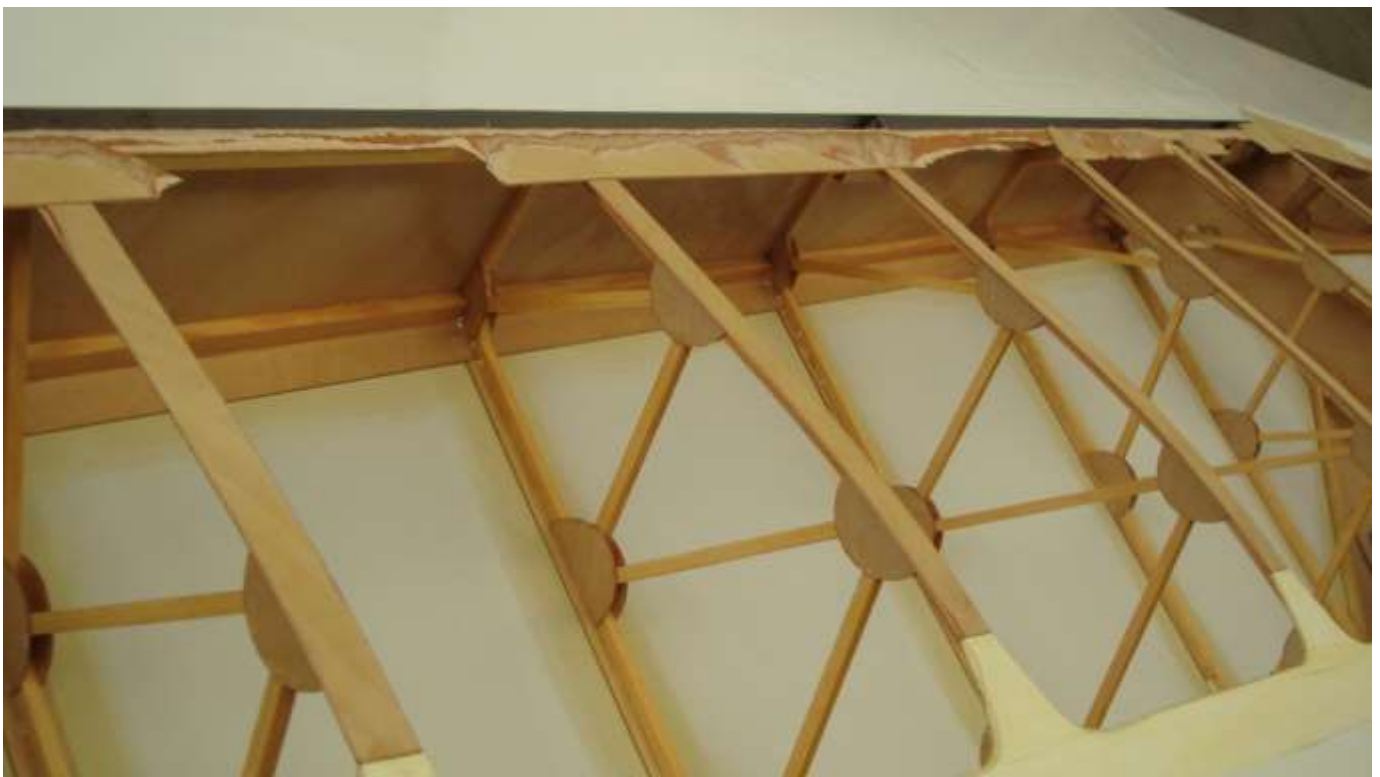
Pic. 2: Fabric coating separated from the upper part of the wing

A separation of the fabric coating from the right wing in-flight was observed at ATEC 122 Zephyr airplane. The airplane returned to the airport and safely landed. The incident occurred due to exceeding of the lifetime of the coating which is 10 years since the airplane came into operation as stated by its manufacturer. The material lifetime can be shortened due to poor condition of the fabric bonding caused by extremely unsuitable climatic conditions. Improper adherence of the fabric coating is indicated by slight lifting or detachment of the fabric on bonded edges or identified by easy intrusion of an applicable sharp thin tool between the fabric coating and inside wing structure. In such case the airplane is considered as not airworthy and it is necessary to make re-coating of all parts of the airplane.