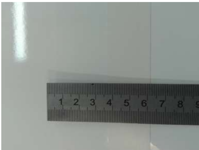
Pic. 4: Detail of the tape covering bonded connection of the coating on torsion box

6. In the Operations and Flight Manual, Par. 8.3., the producer added the definition of TBO, information about its importance: "After the TBO is expired, the next operation of the airplane can not be considered as safe and due to this reason it is not allowed to exceed the TBO limit." and specification of works provided during major overhaul.